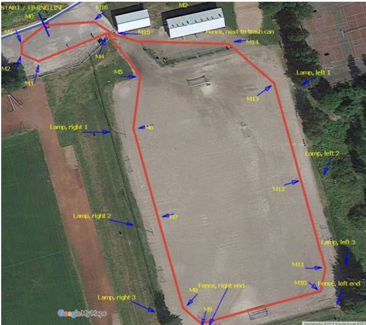
Kuva 2 Short loop and measuring points