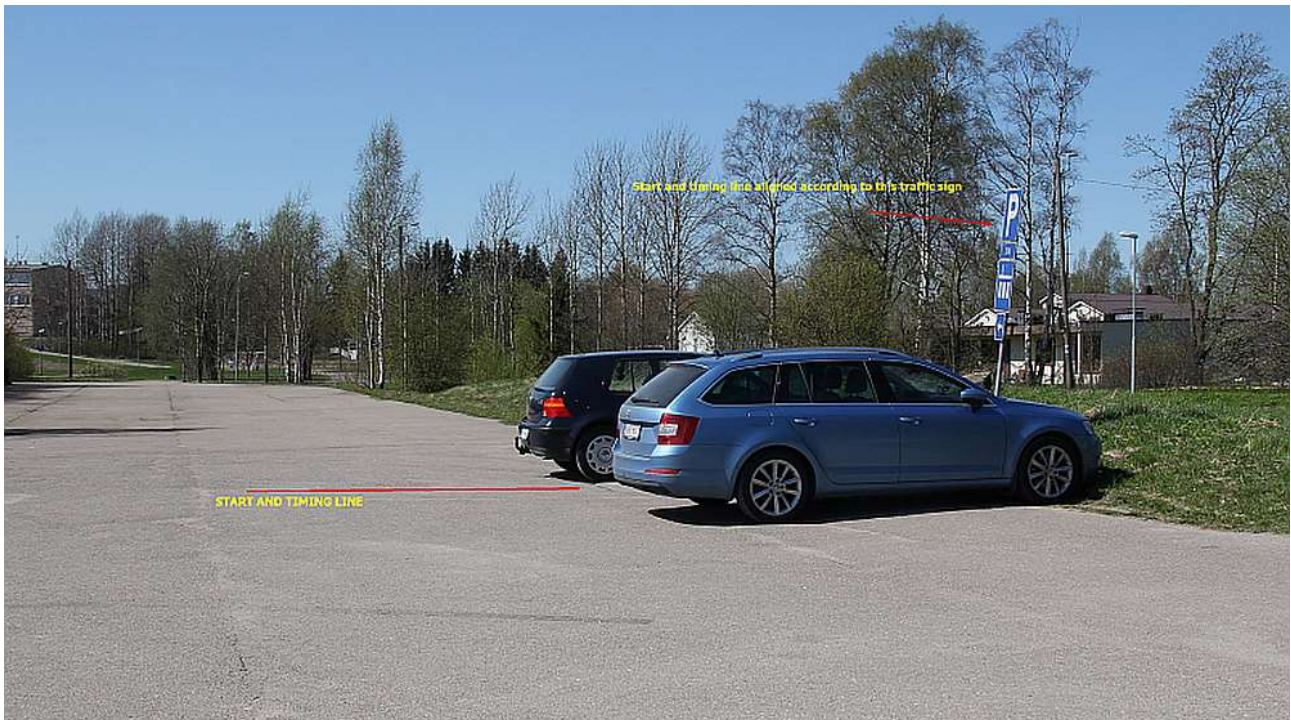
Kuva 1 Location of start and timing line on parking place

More information about the event: http://helsinkiultrarun.fi/eng/